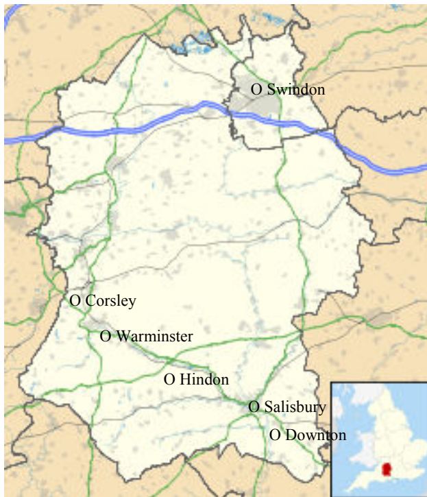
Figure 1 Map of Wiltshire with towns mentioned in this article

The term Moonraker is used to describe people from Wiltshire England, sometimes called the County of Wilts. Wiltshire is in the south west of England (Wessex). It is landlocked and surrounded by the counties of Dorset, Somerset, Hampshire, Gloucestershire, Oxfordshire and West Berkshire.